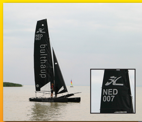
James Bond is coming!